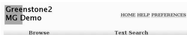
Figure 3: A sample collection page banner

In the standard interface that comes with Greenstone 3 3 , collections in a digital library are presented in the following manner. The ‘home’ page of the library shows a list of all the public collections in that library. Clicking on a collection link takes you to the home page for the collection, which we call the collection’s ‘about’ page. The standard page banner looks something like that shown in Figure 3.