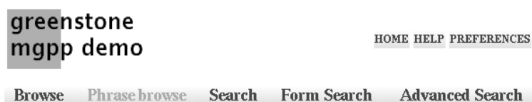
Figure 3: A sample collection page banner

In the standard interface that comes with Greenstone 3 3 , collections in a digital library are presented in the following manner. The ‘home’ page of the library shows a list of all the public collections in that library. Clicking on a collection link takes you to the home page for the collection, which we call the ‘about’ page. The standard page banner looks something like that shown in Figure 3.