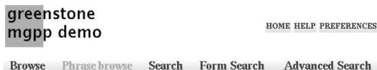
Figure 3: A sample collection page banner

In the standard interface that comes with Greenstone 3 3 , collections in a digital library are presented in the following manner. The ‘home’ page of the library shows a list of all the public collections in that library. Clicking on a collection link takes you to the home page for the collection, which we call the collection’s ‘about’ page. The standard page banner looks something like that shown in Figure 3.